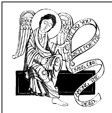
+ bob ruthig & rick ritz

The General Fund harbours significant maintenance items including snow removal, and a large quarterly photocopy bill. The Capital Fund includes the recent acquisition of more hearing assist devices for worship and the generous offsetting donation from the Quilters.